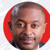
Roundtable panelist IAN GOODING-EDGHILL Minister of Health and Wellness, Barbados