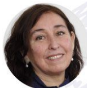
Roundtable panelist Dr MARIA BEGONA YARZA Minister of Health, Chile